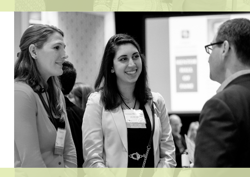
ALL ARE WELCOME