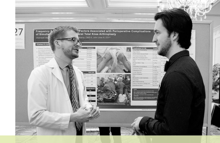
WINNERS WILL BE ANNOUNCED AT NOON

The Heritage College Society of Alumni and Friends, Osteopathic Heritage Foundations, and Ohio Osteopathic Association, in partnership with the Heritage College Office of Student Affairs.